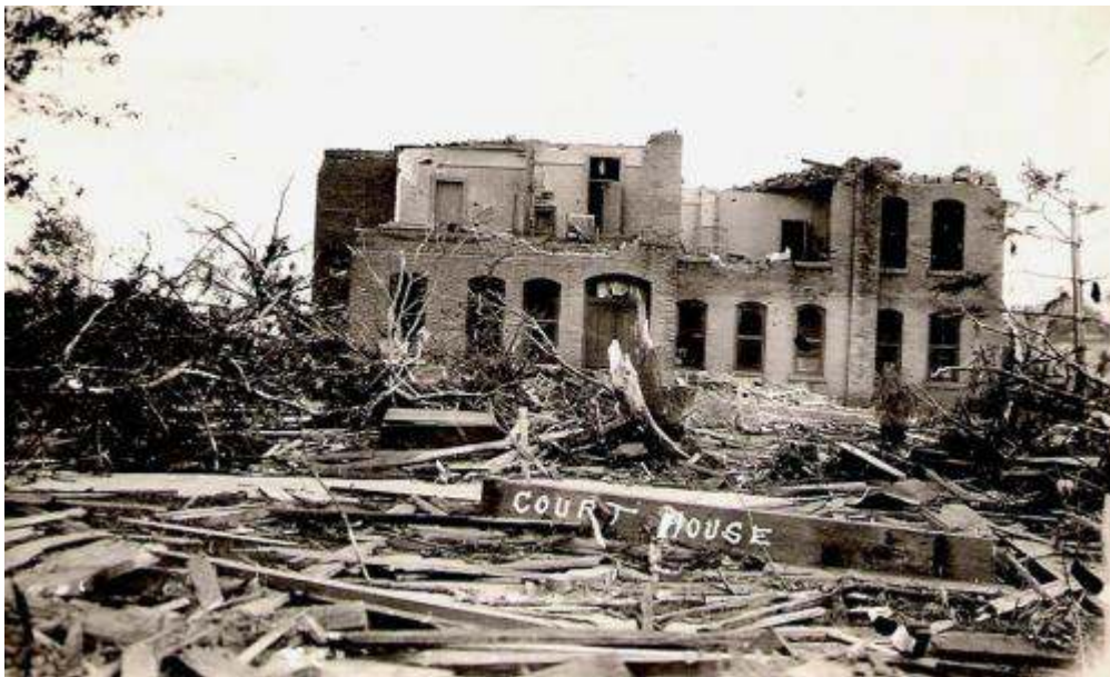
Otter Tail County Courthouse, after it was destroyed by tornado on June 22, 1919.