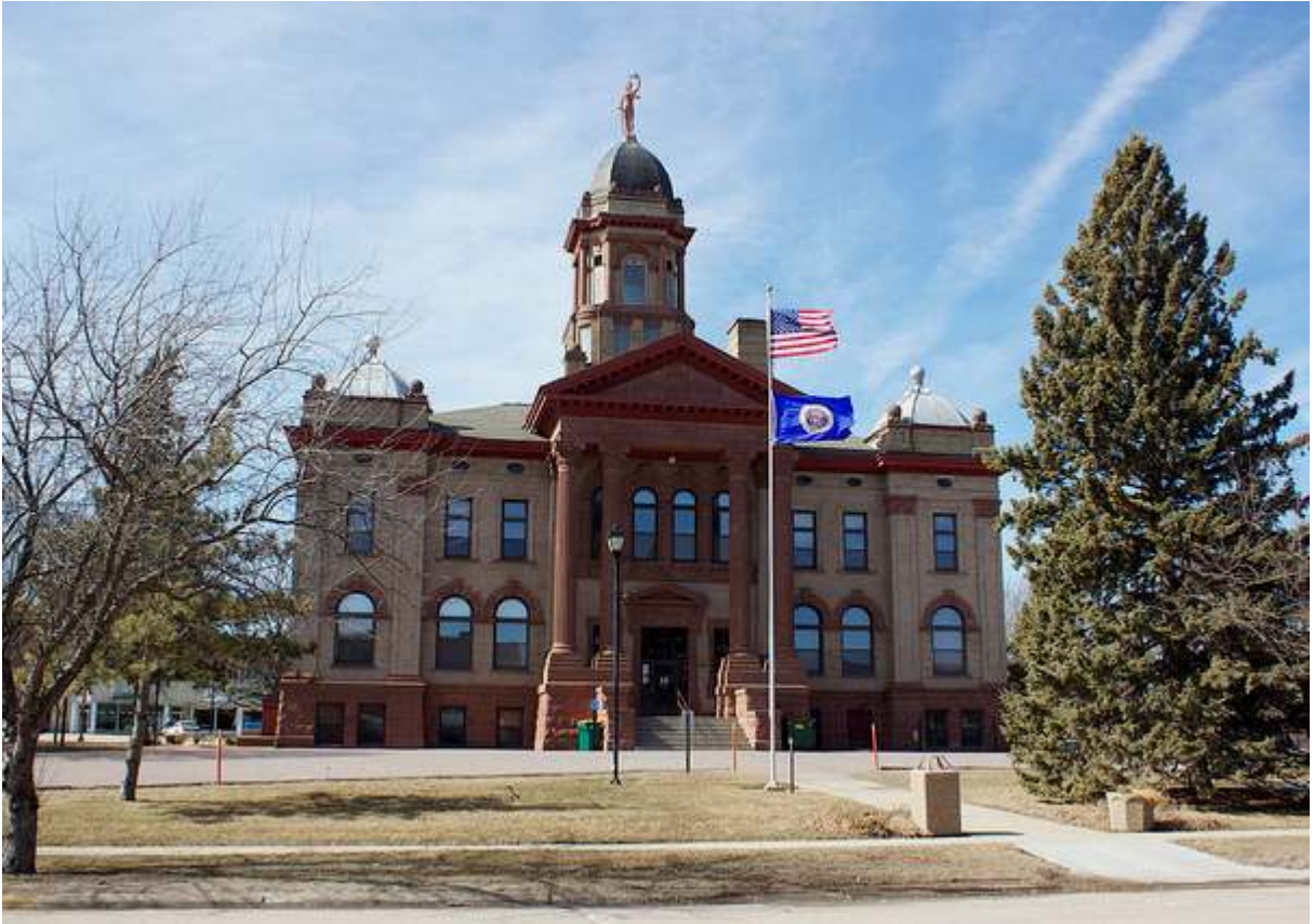
Cottonwood County Courthouse (2012). Windom, Minnesota. Constructed in 1904.