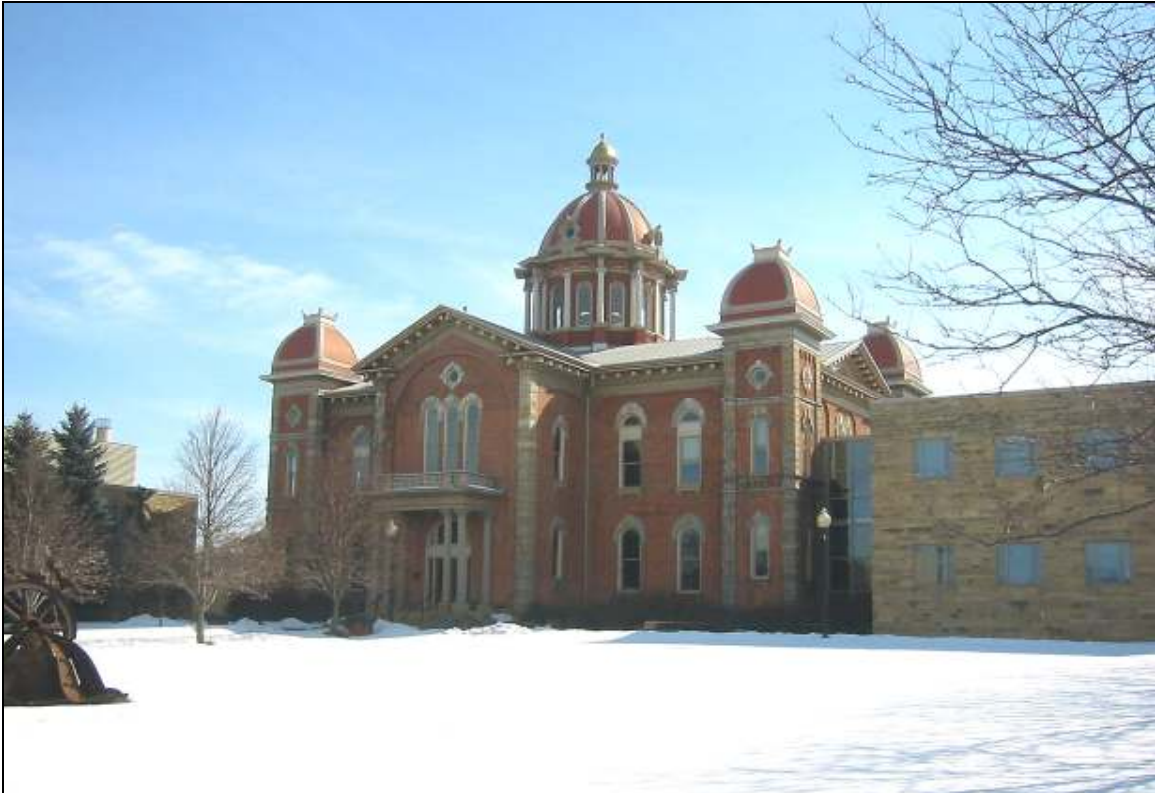
Dakota County Courthouse (2007). Hastings, Minnesota. Constructed in 1869, addition in 1955; now Hastings City Hall.