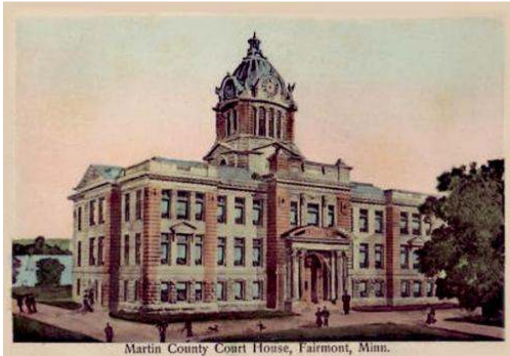
Martin County Courthouse (ca. 1900s). Fairmont, Minnesota.