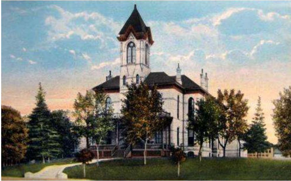
Otter Tail County Courthouse (ca.1910). Fergus Falls, Minnesota