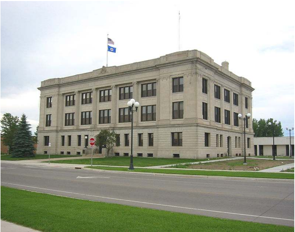
Crow Wing County Courthouse & Jail (2006). Brainerd, Minnesota. Completed in 1920.