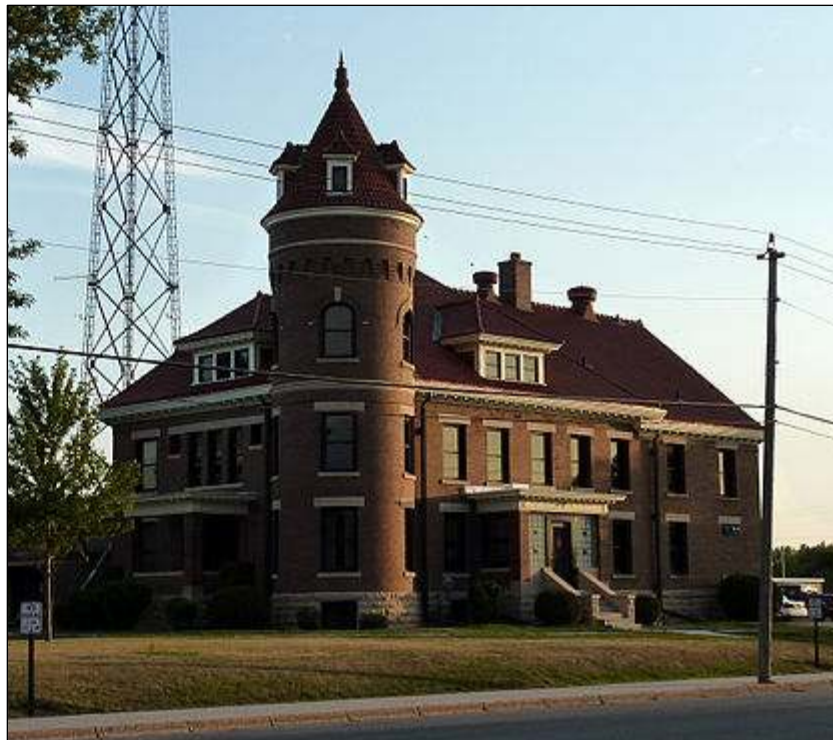
Le Sueur County Courthouse (top) and Jail (below)(2009). Le Center, Minnesota.