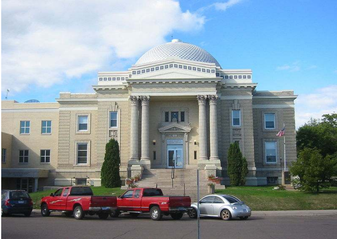
Lake County Courthouse & Sheriff's Residence (2007). Two Harbors, Minnesota. Constructed in 1906.