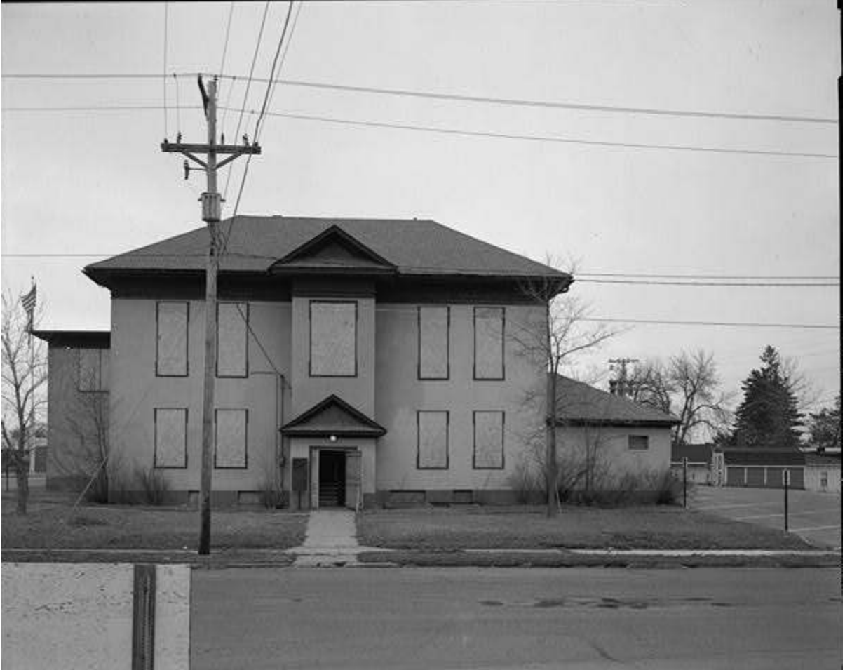
Sherburne County Courthouse Elk River, Minnesota