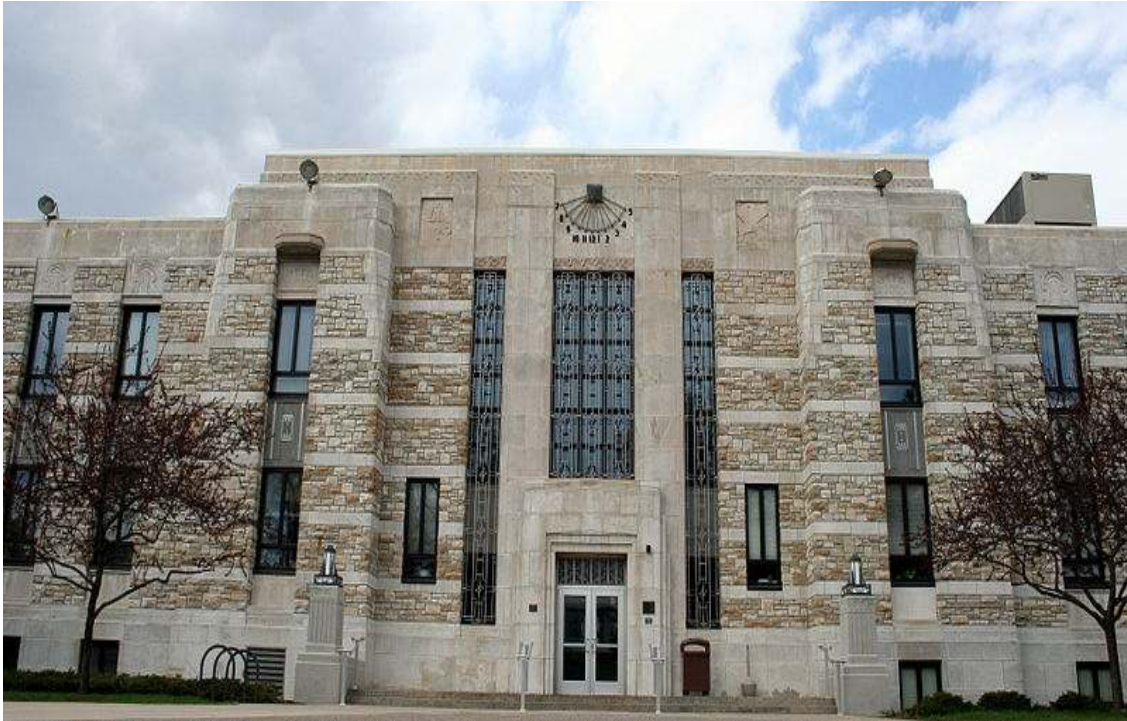
Rice County Courthouse (2009). Faribault, Minnesota. Southside of Courthouse, which was built in 1934.