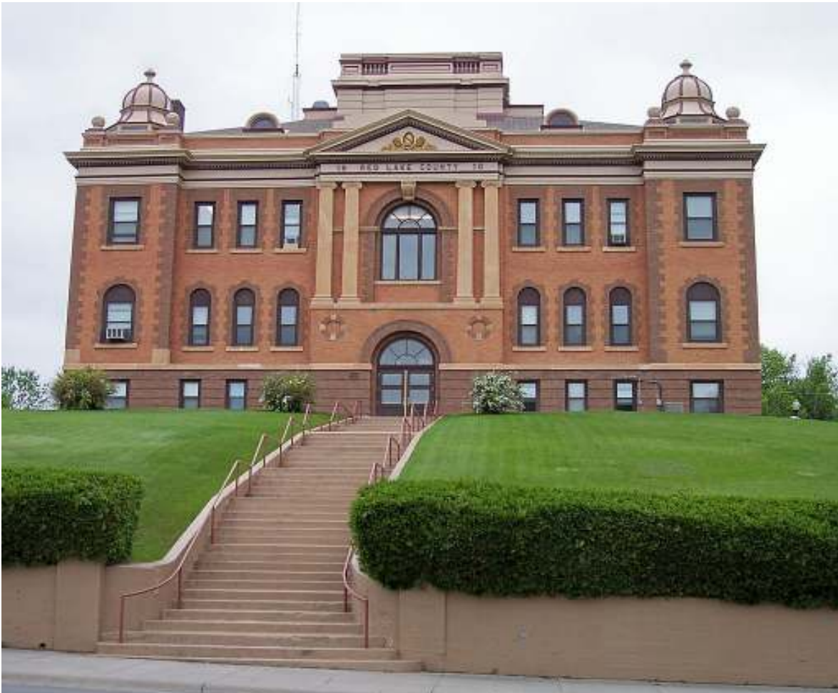
Red Lake County Courthouse (2007). Red Lake Falls, Minnesota.