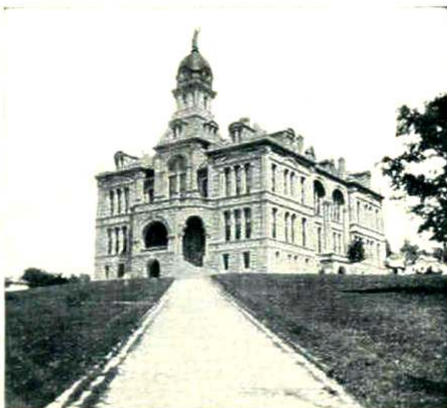
Court House, Mankato, Minn.

Blue Earth County Courthouse (ca. 1900s). Mankato, Minnesota.