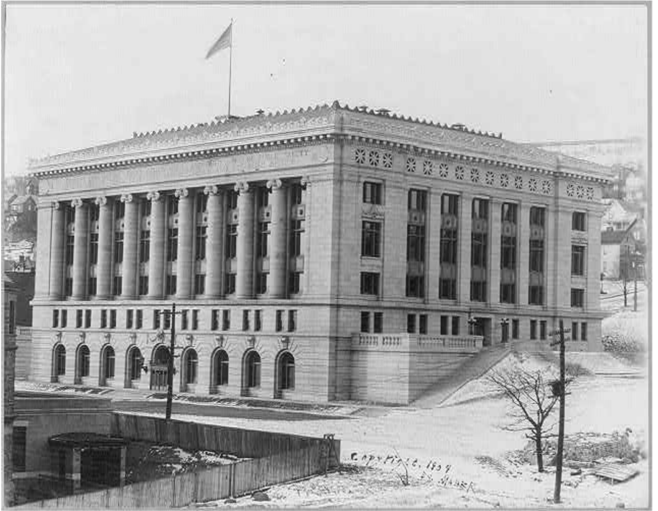
St. Louis County Courthouse (ca. 1909). Duluth, Minnesota.