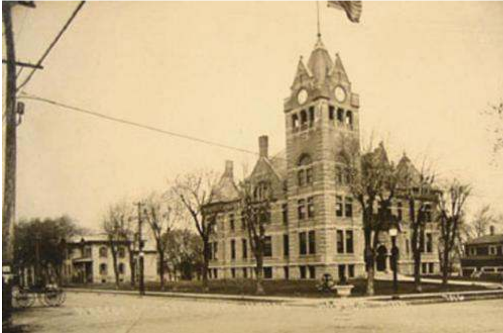
Waseca County Courthouse (ca. 1900s). Waseca, Minnesota