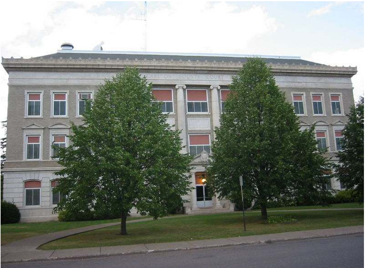
Carleton County Courthouse (2007). Carleton, Minnesota. Completed in 1924, Source: Elkman, photographer; Wikimedia Commons.