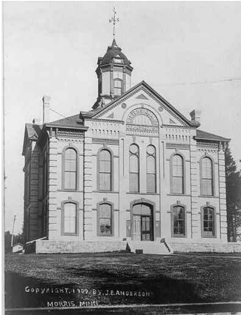
Stevens County Courthouse (1909). Morris, Minnesota