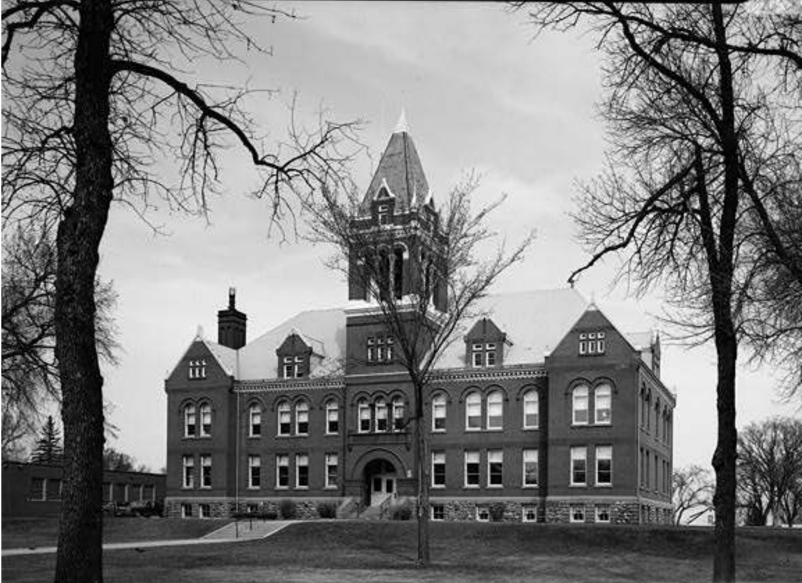
La Qui Parle County Courthouse (ca. 1990). Madison, Minnesota.