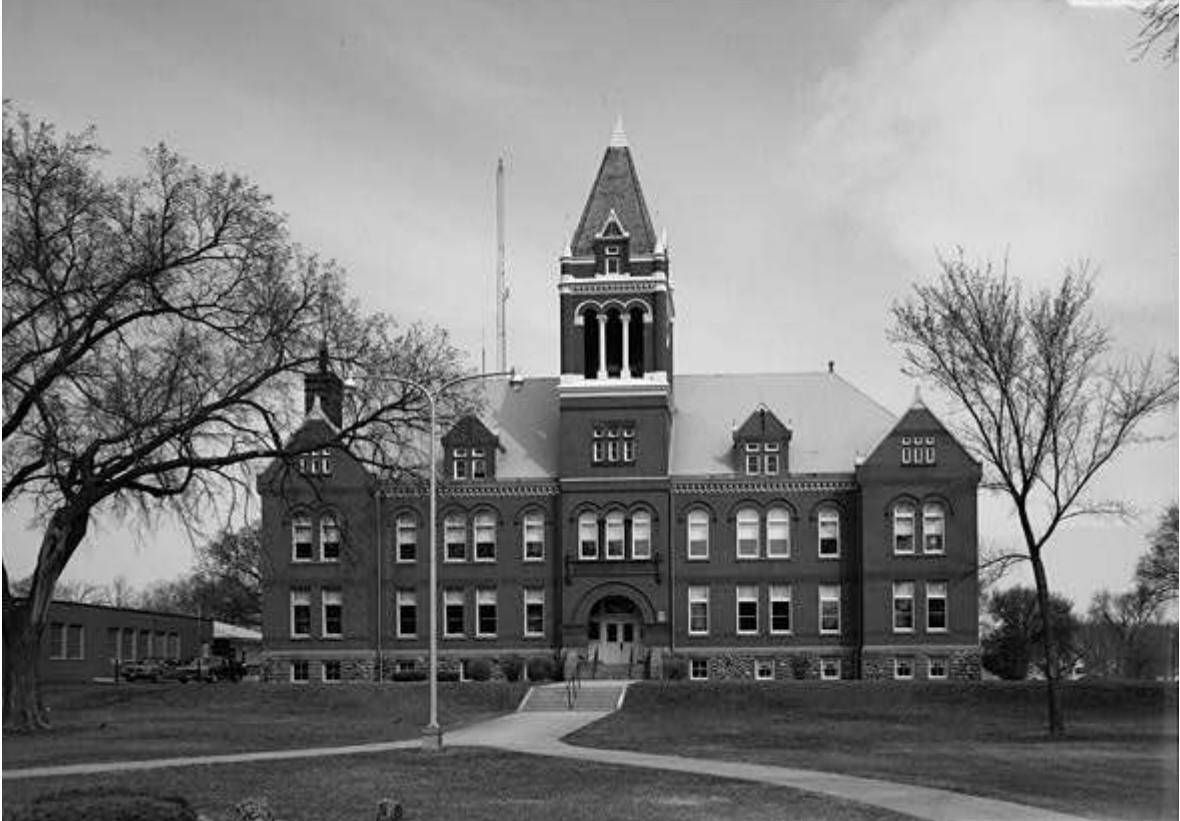
La Qui Parle County Courthouse (ca. 1990). Madison, Minnesota.