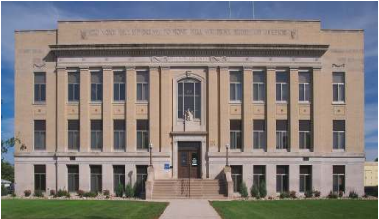
Wilkin County Courthouse (2013). Breckenridge, Minnesota. It was constructed in 1928.