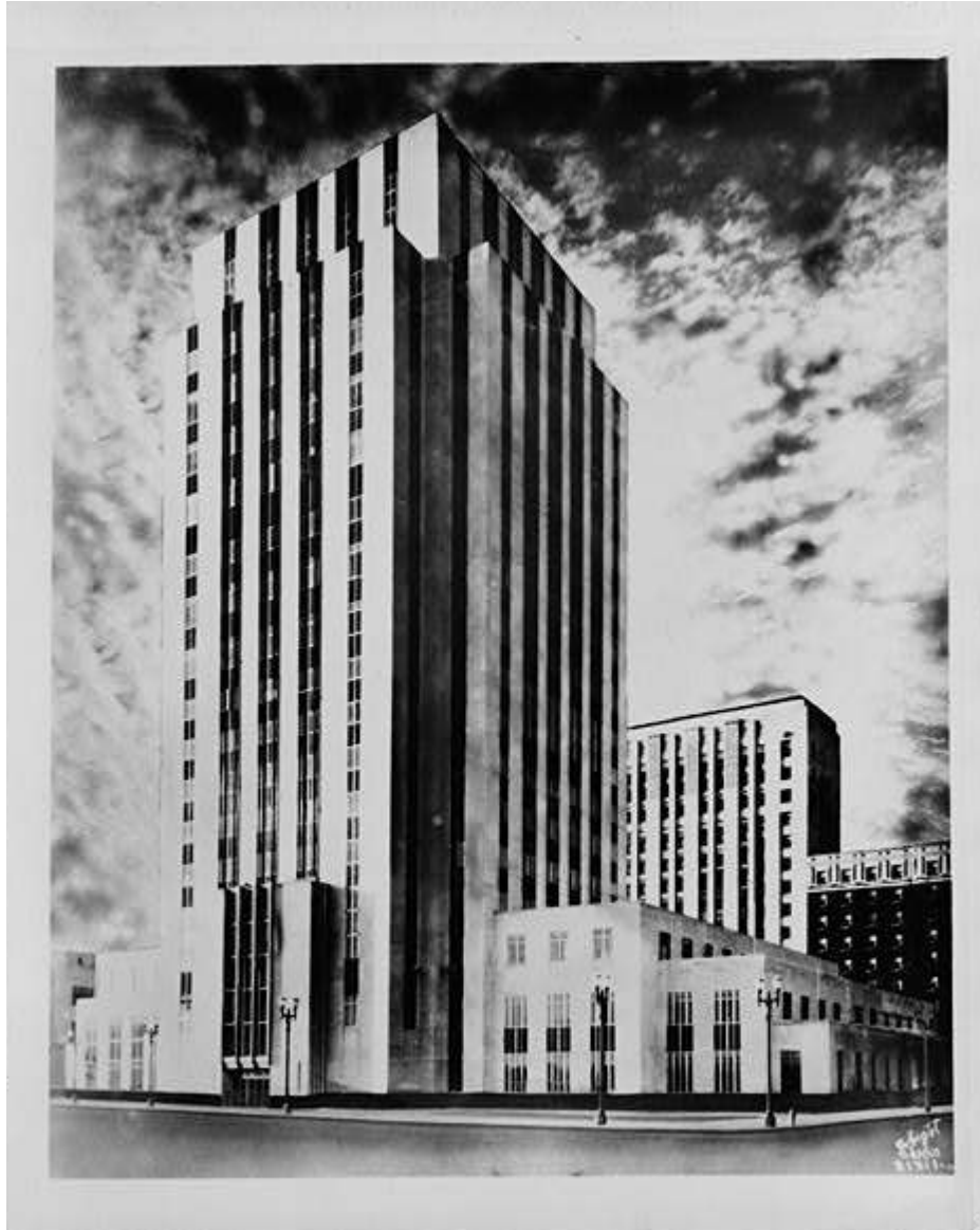
Photocopy of a drawing of the St. Paul City Hall-Ramsey County Courthouse. St. Paul, Minnesota.

Erected 1932. Date of Photocopy is unknown.