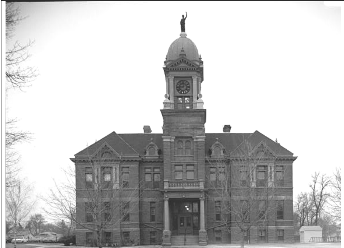
Pipestone County Courthouse Pipestone, Minnesota