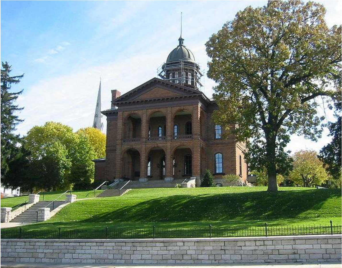
Washington County Courthouse (2006). Stillwater, Minnesota. Occupied in 1870.