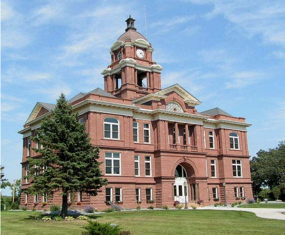
Grant County Courthouse (2012). Elbow Lake, Minnesota. Building constructed in 1906.