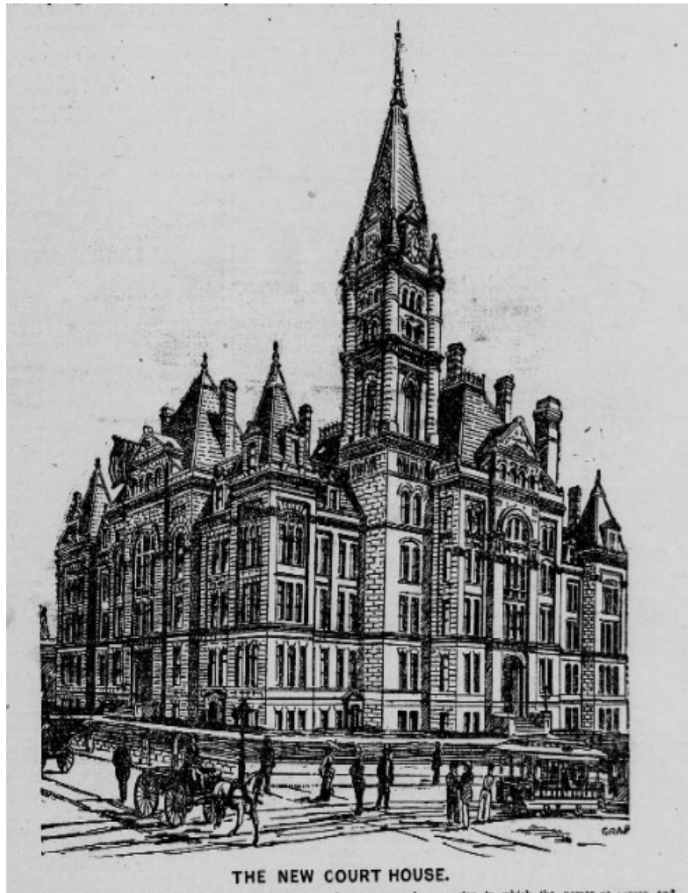
St. Paul City Hall & Ramsey County Courthouse (1889). Drawing of Courthouse on the day of its opening. Source: St. Paul Daily Globe, May 7, 1889.