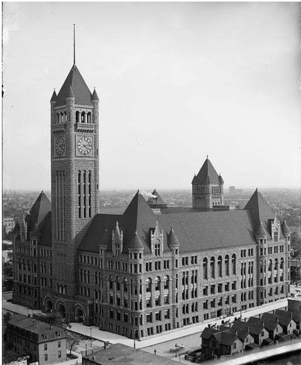
Minneapolis City Hall & Hennepin County Courthouse (ca. 1905). Minneapolis, Minnesota.