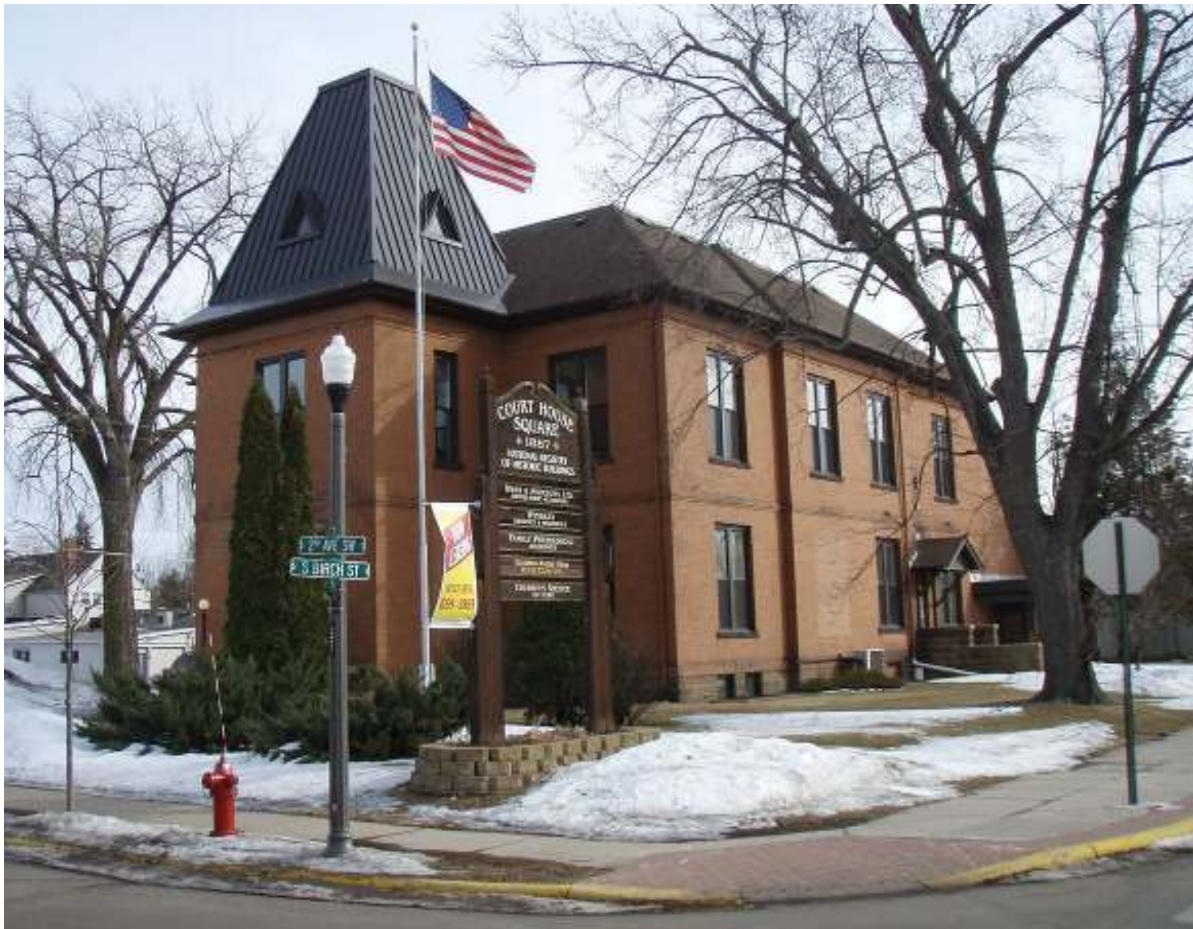
Isanti County Courthouse (2009). Cambridge, Minnesota. Built in 1888, now a private office building.