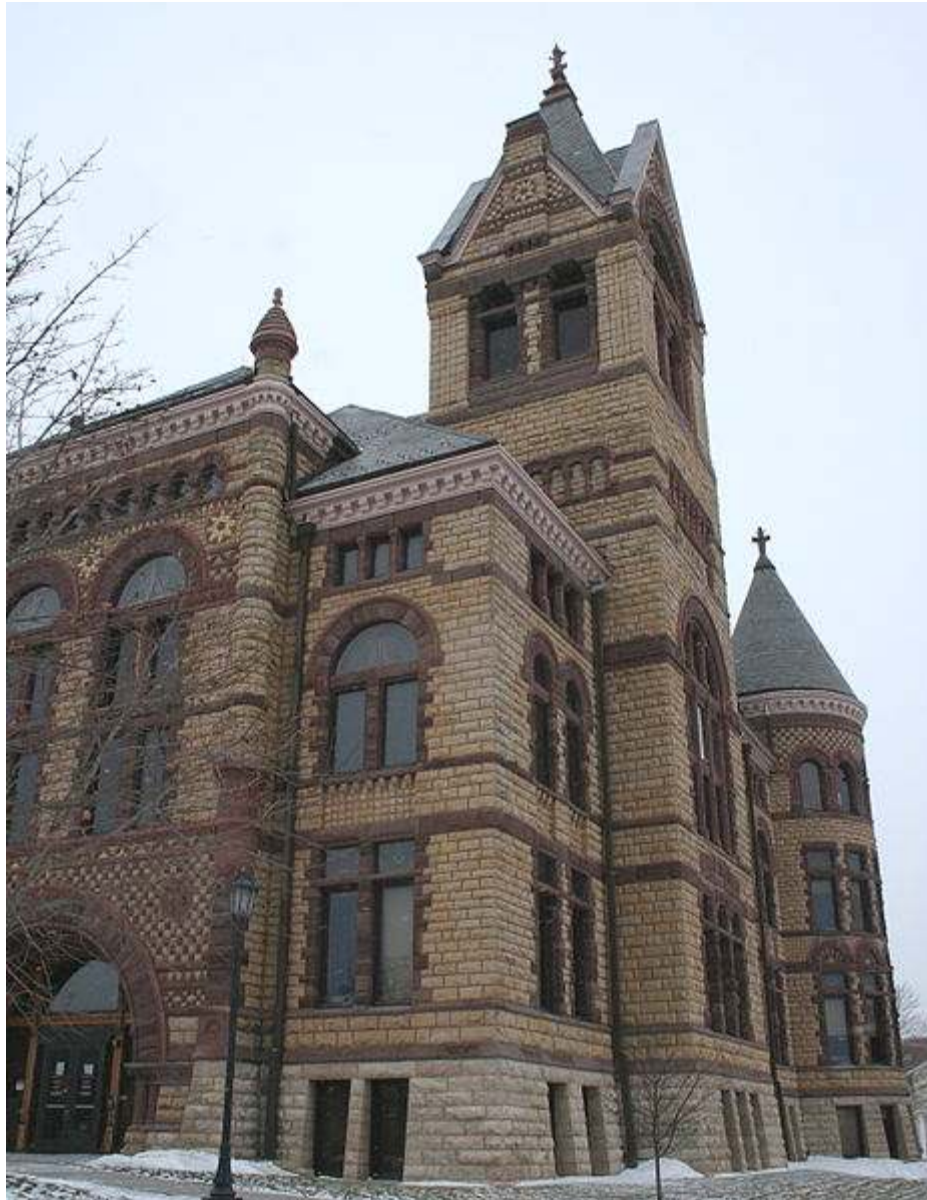
Winona County Courthouse (2009).