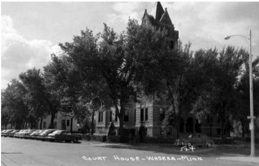
Waseca County Courthouse (ca. 1940s). Waseca, Minnesota