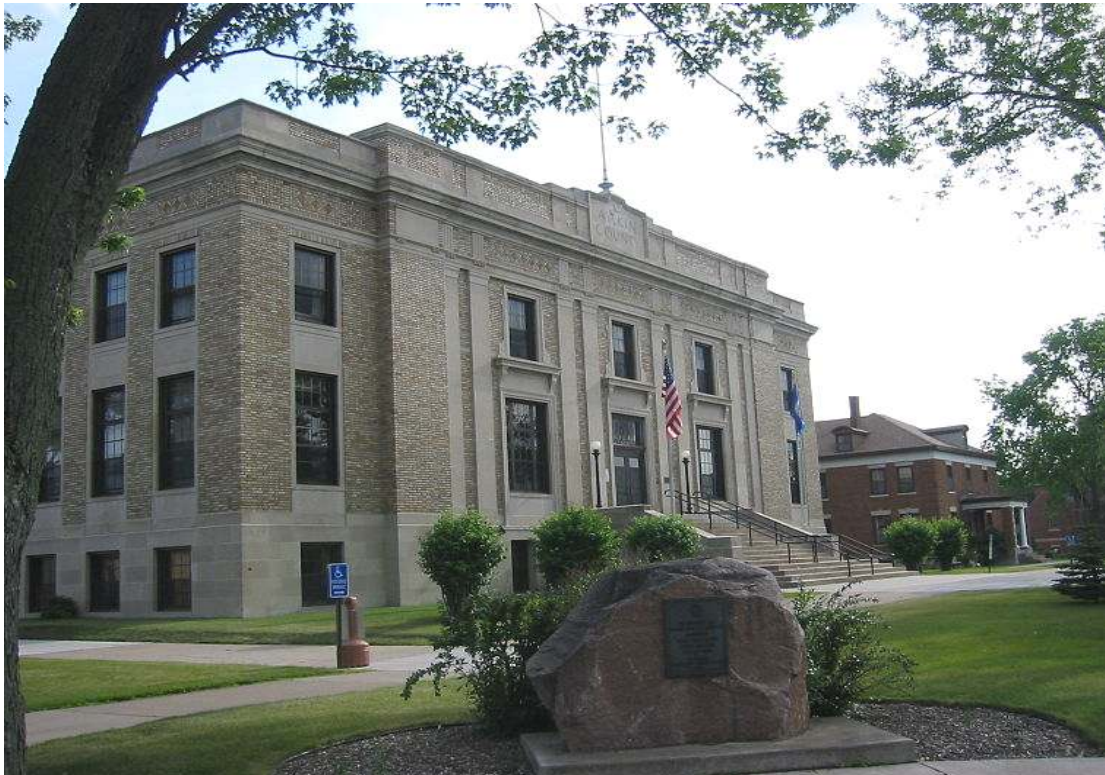
Aitkin County Courthouse and Jail (2007). Aitkin, Minnesota Building completed 1929.