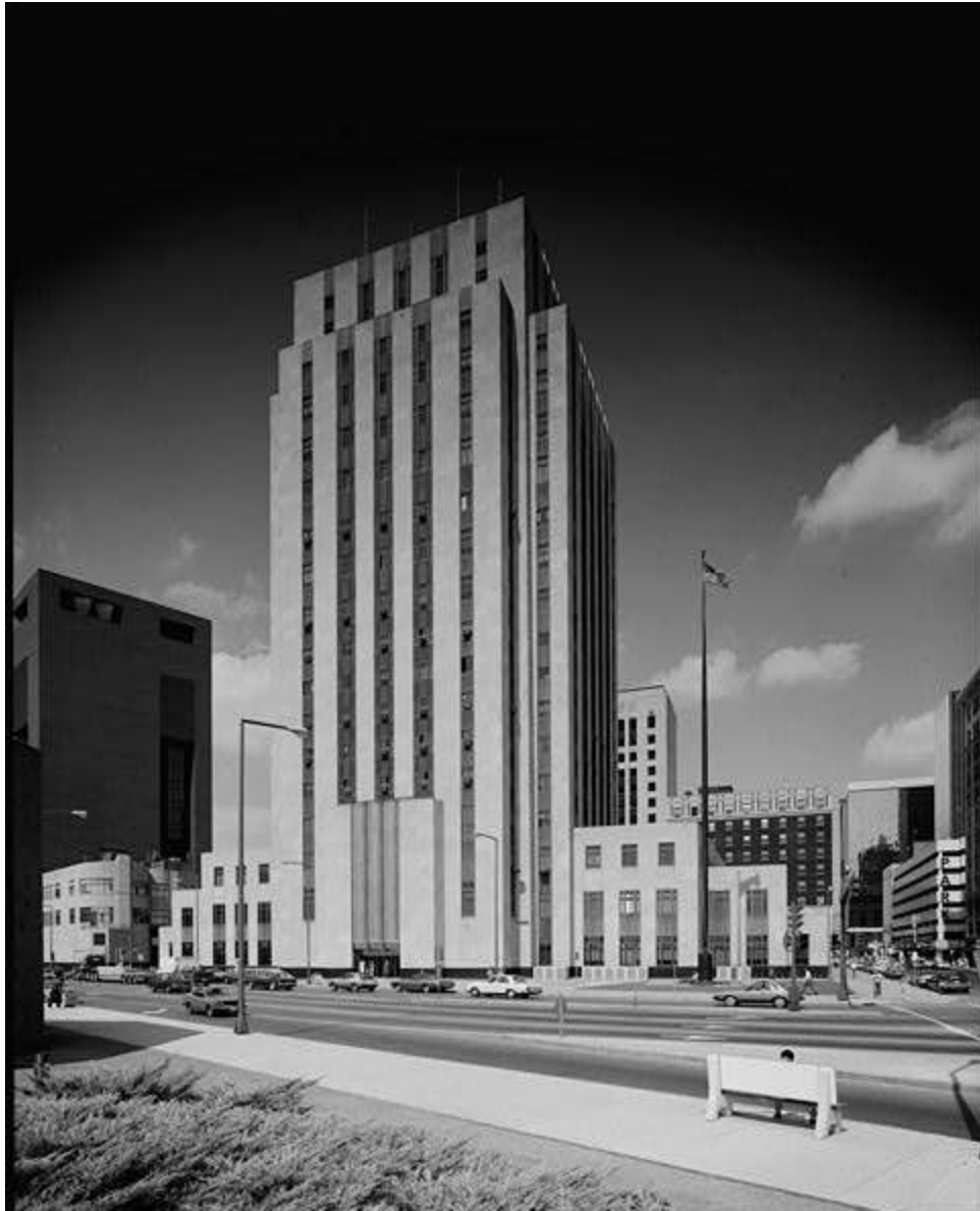
St. Paul City Hall & Ramsey County Courthouse. Erected 1932. St. Paul, Minnesota