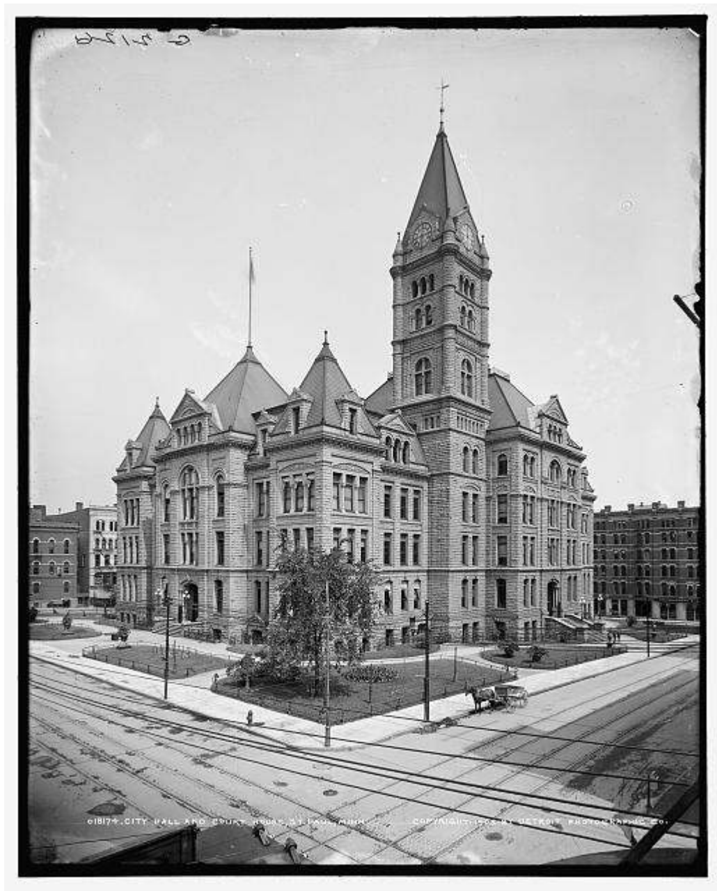
St. Paul City Hall & Ramsey County Courthouse (ca. 1905). St. Paul, Minnesota.