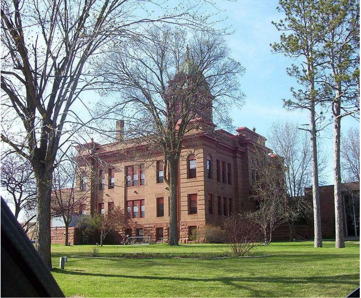
Beltrami County Courthouse (2006). Bemidji, Minnesota. Constructed 1902-1903.