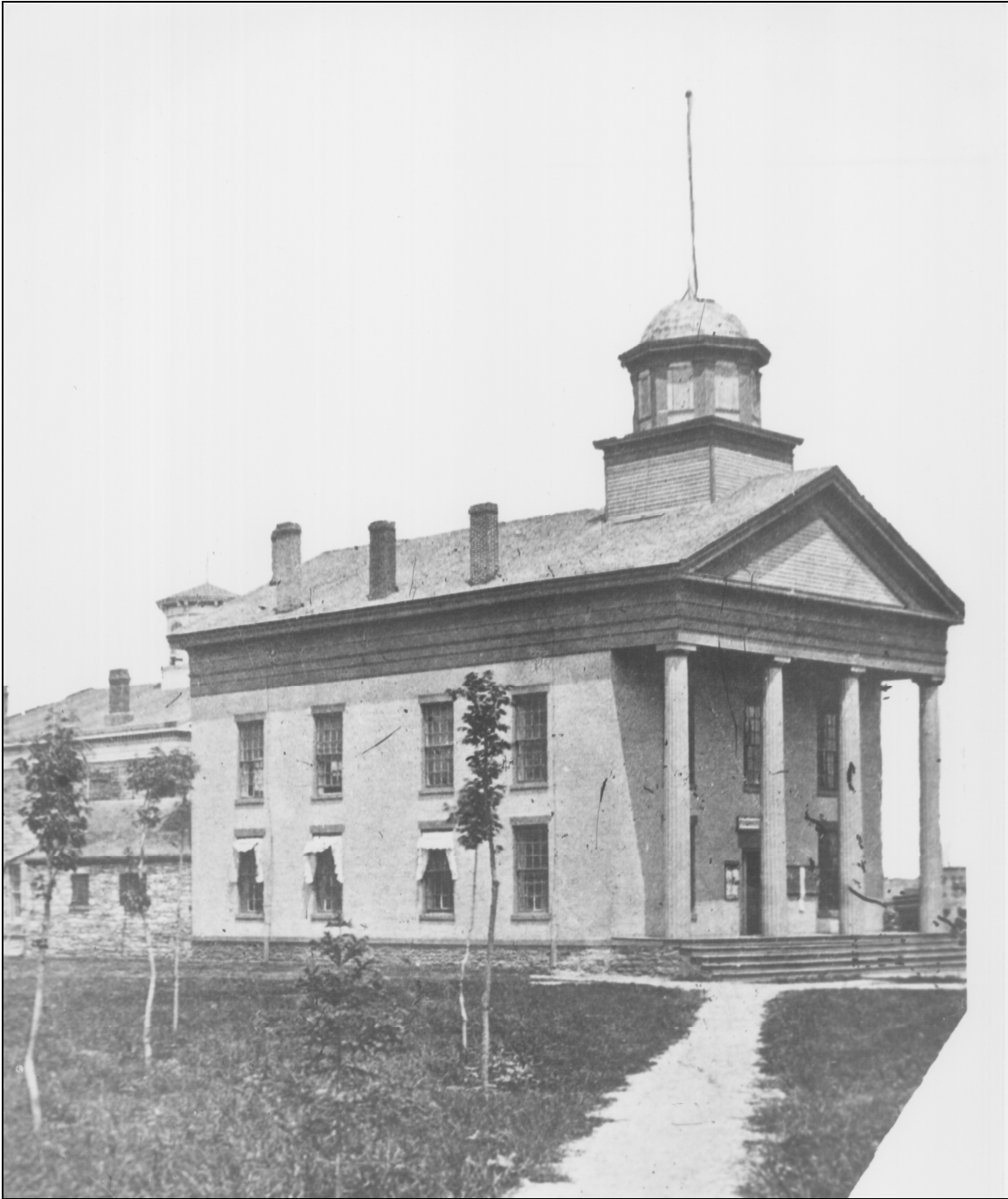
Court House in St. Paul (ca. 1860s). 4th Street & Wabasha Street. Erected in 1850-1851.