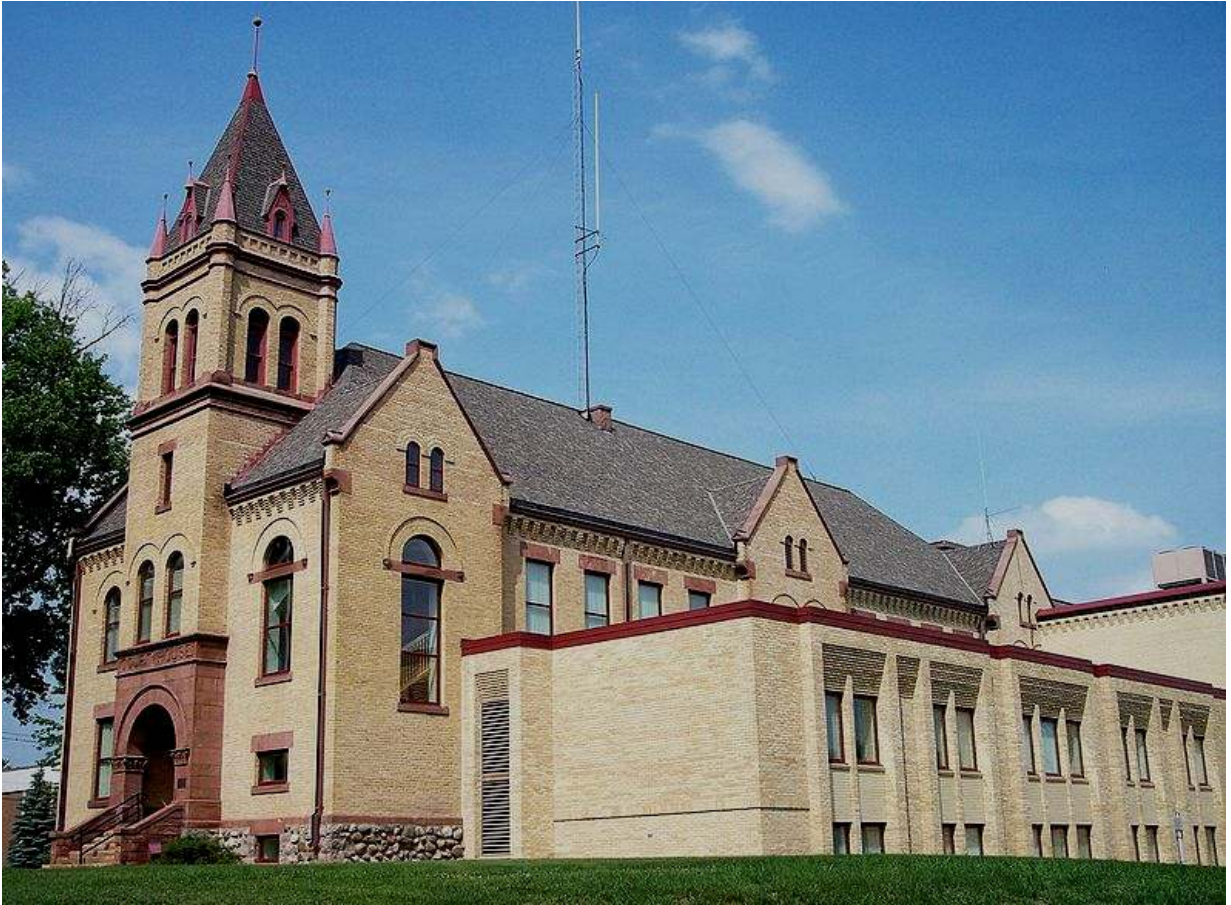
Kanabec County Courthouse (2009). Mora, Minnesota. Built in 1894.