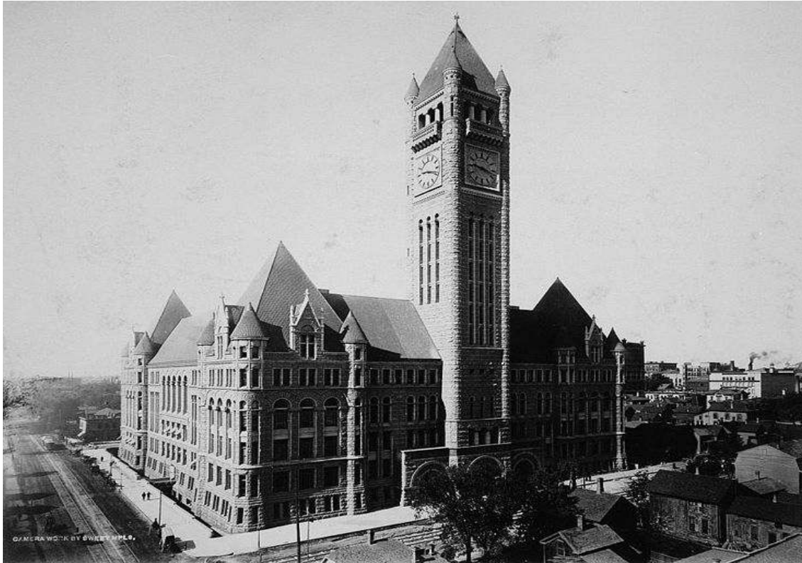
Minneapolis City Hall & Hennepin County Courthouse (ca. 1900). Minneapolis, Minnesota.