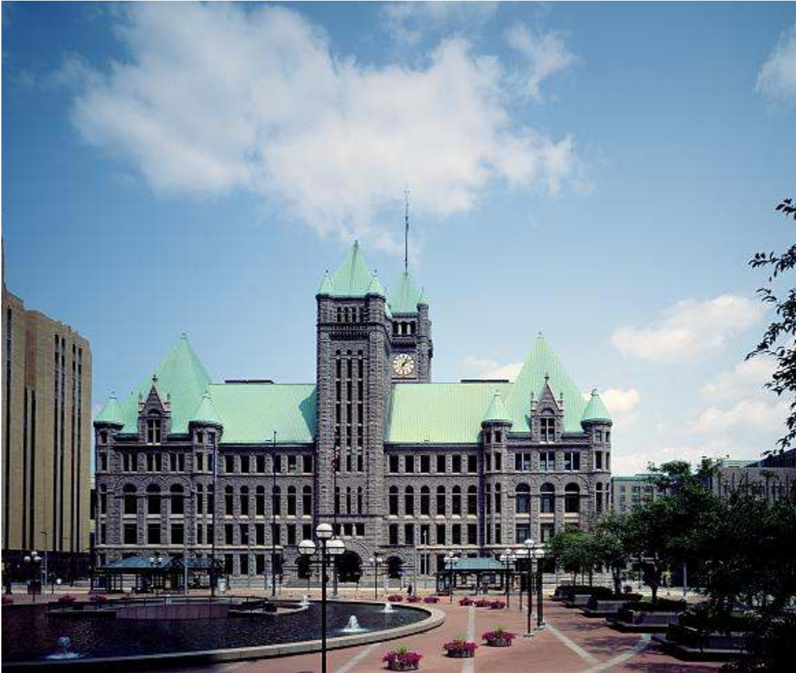
Minneapolis City Hall & Hennepin County Courthouse.