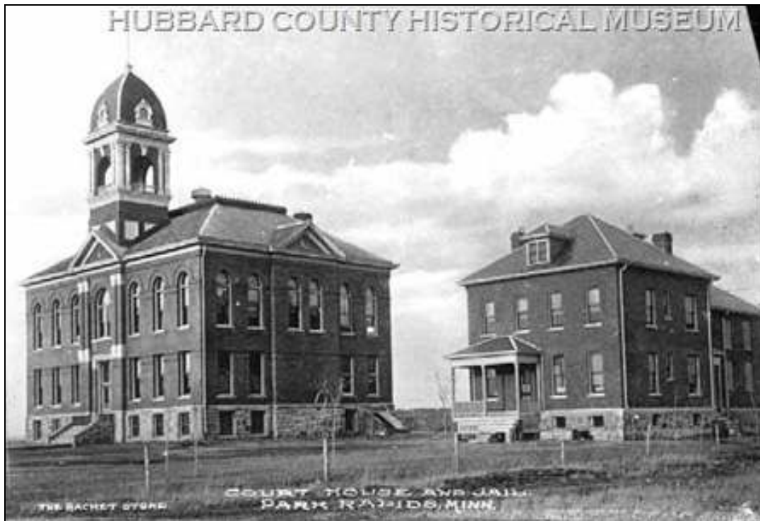
Hubbard County Courthouse & Jail (ca. 1909). The courthouse was completed in 1900. Park Rapids, Minnesota.