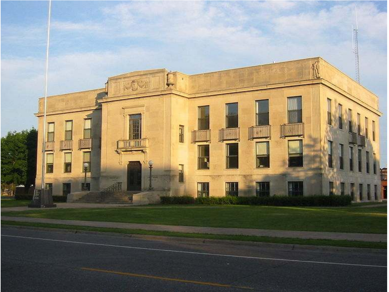
Mille Lacs County Courthouse (2007). Milaca, Minnesota. Completed in 1923.