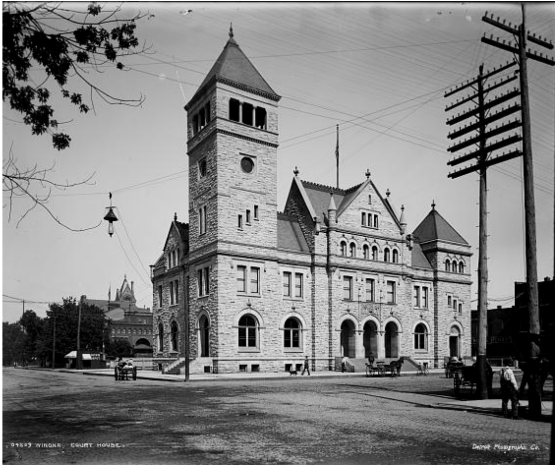
Winona County Courthouse (ca. 1880s). Winona, Minnesota