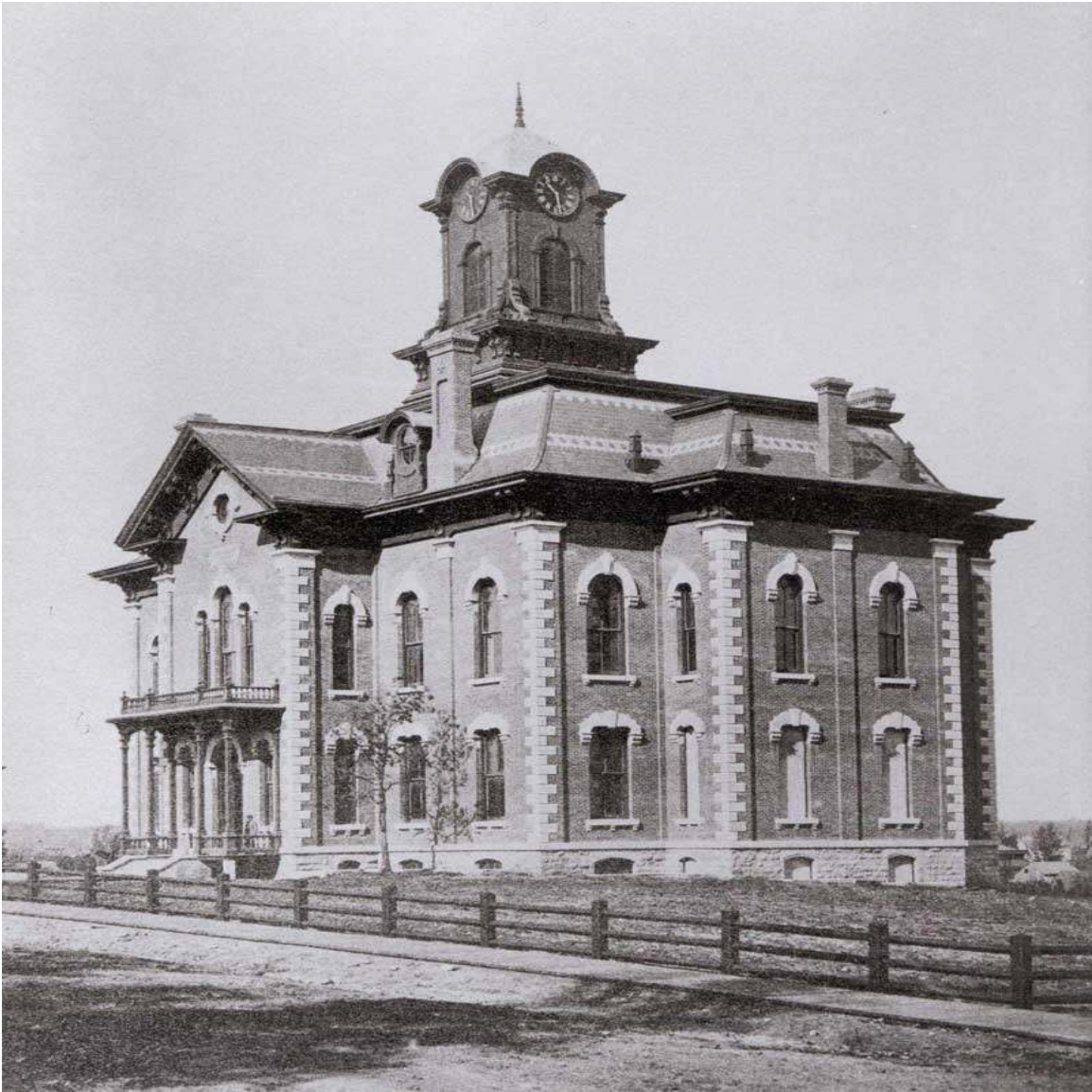
Rice County Courthouse (built 1874). Faribault, Minnesota.