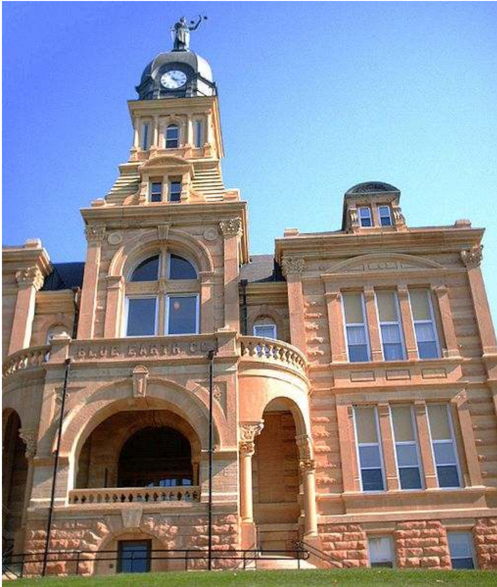
Blue Earth County Courthouse (2006), Mankato, Minnesota. Building completed in 1886.