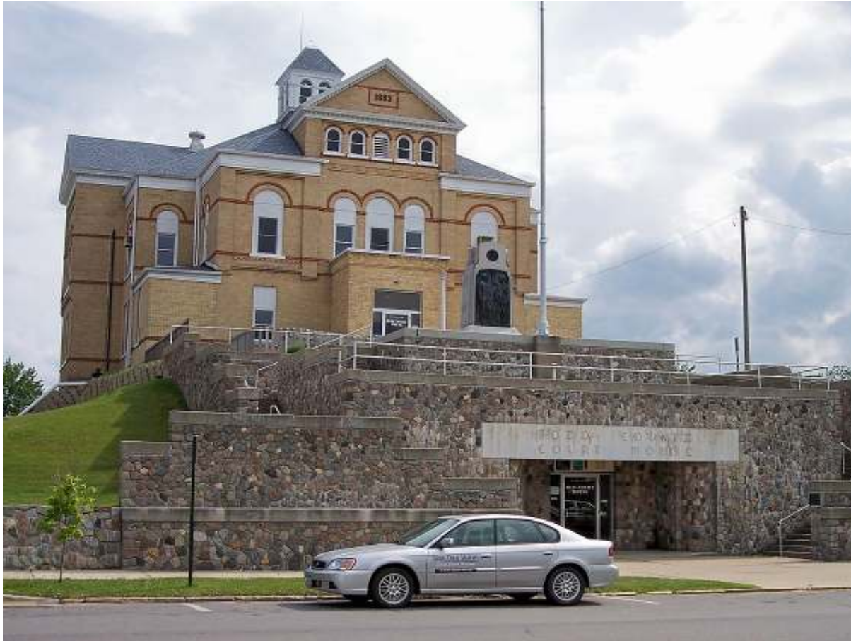
Todd County Courthouse, Sheriff's Residence & Jail (2007). Long Prairie, Minnesota. Constructed in 1883 and vacated in 2006.