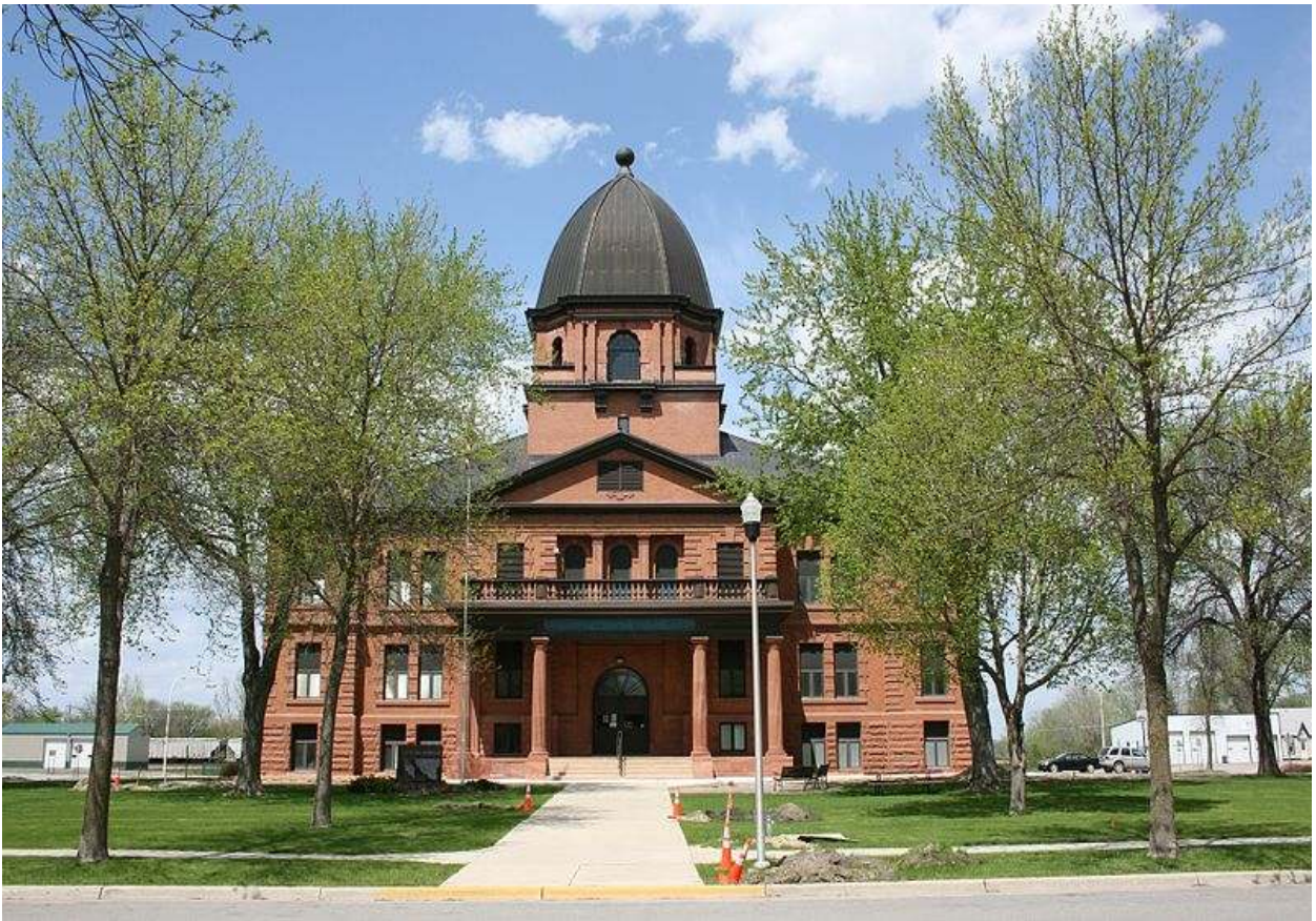
Renville County Courthouse (2008).